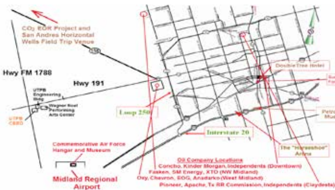
Overall View of Horseshoe Facility

Shuttle vans available from Horseshoe Facility back to DoubleTree Hotel after the day's events (Mon-Thurs). Shuttle vans available to/from Horseshoe Facility to Commemorative Air Force Hangar 5:30 pm and 7:30 pm (Monday).